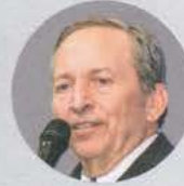
Lawrence H. Summers Harvard University