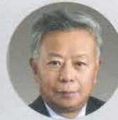
Jin Liqun Asian Infrastructure Investment Bank