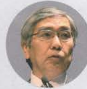
Haruhiko Kuroda Bank of Japan