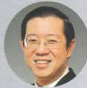
Lim Guan Eng Minister of Finance of Malaysia