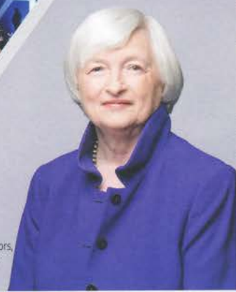
Janet L. Yellen Chair, Board of Governors, Federal Reserve System (2014-2018)