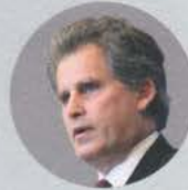
David Lipton International Monetary Fund